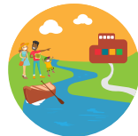
Chart the Course To Grand Opening!

111 7th Avenue South • Saint Cloud, MN 56301