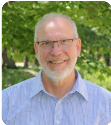
Glen Palm Museum Co-founder Board Chair

Sharpening these skills at Great River Children's Museum and beyond will instill a sense of confidence in children as they continue to make sense of the world around them.