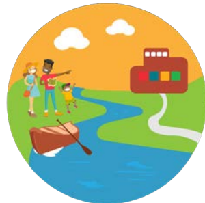
Chart the Course To Grand Opening!

Together, let's build a playground of possibilities where curiosity knows no bounds!